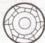
6 TOOTH CUTTER SHOWN